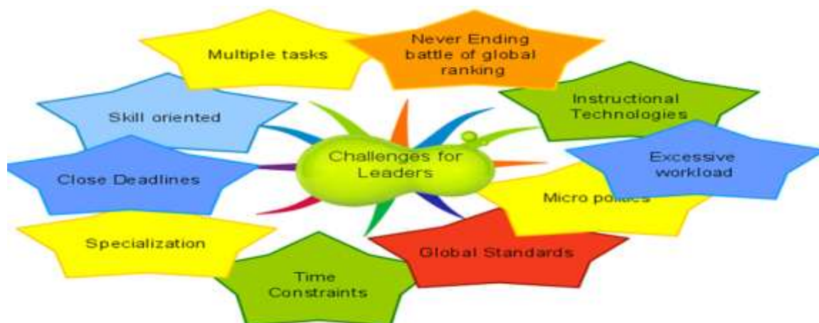
Figure 3: 21 st Century challenges for leaders