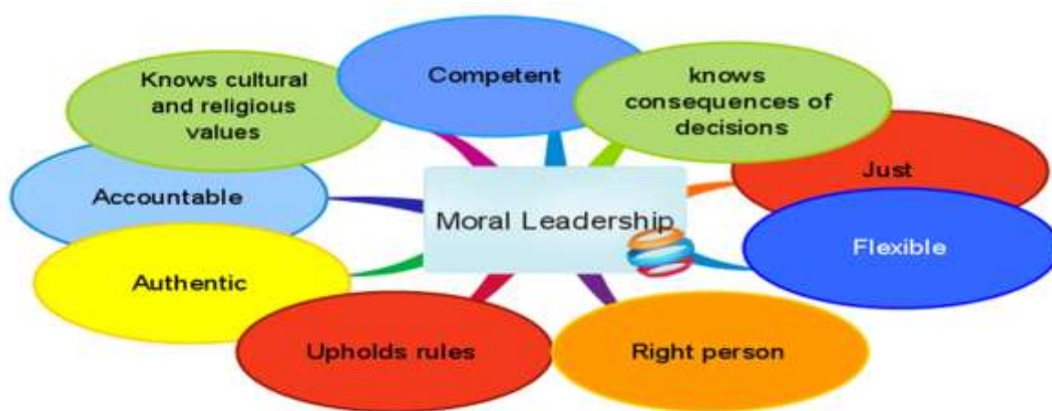
Figure 2: Concept of moral leadership

leader is a right person; she has herself a good character and has fair practices but it is a complex phenomenon...some leaders may be fair in dealing with financial matters but they are rude with people and vice versa'. R12 commented in a different way and said. 'If you are good with people but incompetent, then you cannot be moral because morality means justice and if you do not deserve your leadership then you cannot be moral'. R8 explained comprehensively that, 'a moral leader is well aware of cultural, religious and social norms and concerned for human rights and strives for upholding rules'. R4, R7, R8, R9 and R10 claimed that they think that they are moral leaders and they keep in mind consequences of their decisions for the world and the hereafter. They think that they are accountable for their position and they always prefer right action. They are straight forward and caring towards their staff and students.