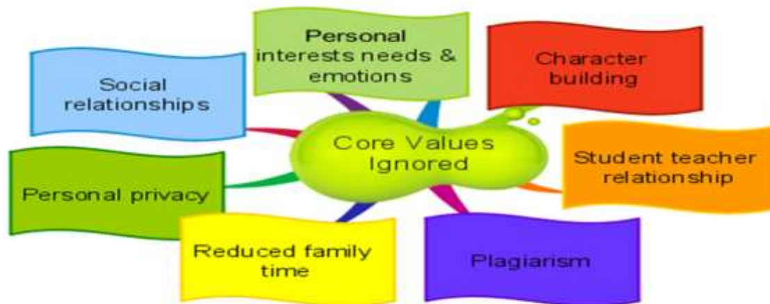
Figure 6: Core values ignored by educational leaders

confessed that universities spare less time to concentrate upon character building of their students because the number of disciplines to be covered has increased and there is no time for teachers to build character through preaching or guiding in the classrooms.