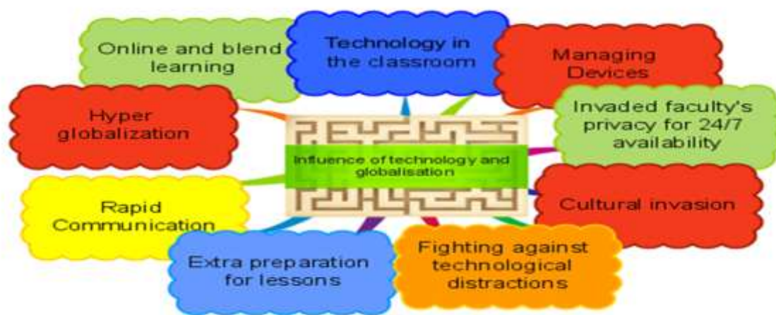
Figure 4: Influence of technology and globalization

homes, and they had to engage their faculty also. R6, R10 and R12, spoke loudly against challenges of technology and commented that the faculty had to prepare extra material for teaching to keep up with international standards. Educational leaders said that they had to fight against cultural invasion, technological distractions of students, i.e. their excessive use of social sites, threats to privacy and hacking etc. R4 said, 'I have to spend several sleepless nights just to cope up with technological demands of my courses... laptop is on my bed, in my kitchen and in my lounge' .