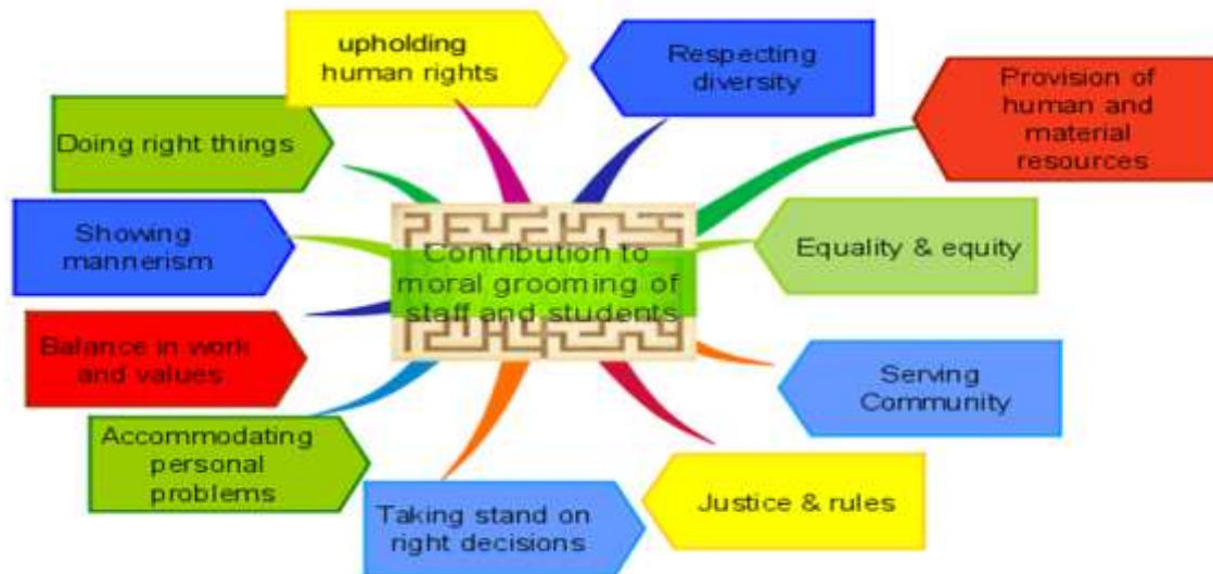
Figure 7: Moral contribution by educational leaders