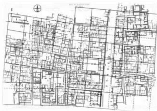
Figure 2 Grid pattern of HR area, Mohenjo-Daro (Excavation plan Marshall, 1993, V. 3; original scale 1:250)